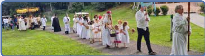
Eucharistic procession to Our Lady Help of Christians Chapel