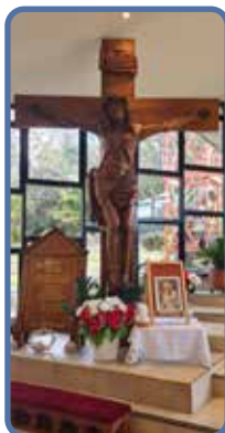
Crucifix & Plaque