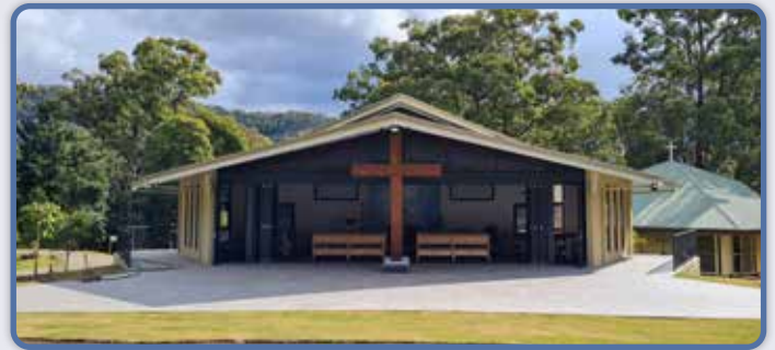
Divine Mercy Chapel

All are welcome to come and pray at the Divine Mercy Chapel at Marian Valley, Canungra.