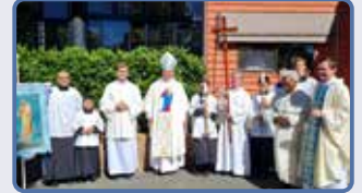
Our Lady Help of Christians day

On Saturday 20 May 2023, Marian Valley celebrated the Solemnity of Our Lady Help of Christians, Patroness of Australia. Around 350 pilgrims attended the mass, including the Eritrean Community.