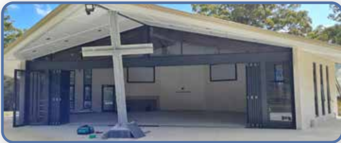
Divine Mercy Chapel

The Divine Mercy Chapel construction is continuing to progress well. Currently, work is underway on the chapel interior including the side altars and the beautiful furniture.