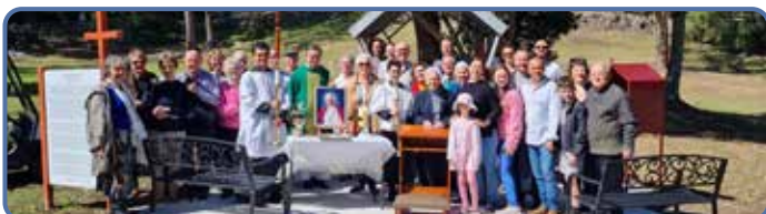
Members and families of the Association