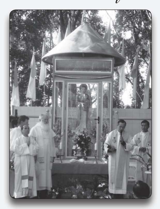
Blessing of the Vietnamese Chapel of Our Lady of Lavang