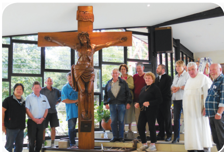
Raising of the Cross with the many volunteers who assisted on the day.