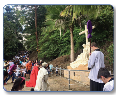
Stations of the Cross on Good Friday

From 7am, thousands of pilgrims arrived during Good Friday at Marian Valley to pray the Stations of the Cross. Many came with their community. It is always an amazing sight to witness so many pilgrims making the journey along the Stations of the Cross during this day.