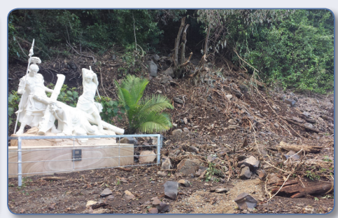
Damage at Station 3