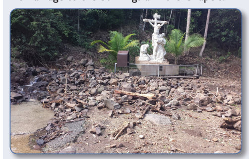
Damage at Station 12

However, thanks to the efforts of hard working Volunteers, most of the repairs were completed in time for Good Friday. Miraculously, there was no damage to the buildings and the Chapels.