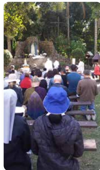
Our Lady of Fatima Grotto

He who prays most receives most - St Alphonsus Maria de Liguori