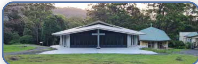
Divine Mercy Chapel

The Divine Mercy Chapel is starting to take shape. With the glass installation, it is now at lockup stage.