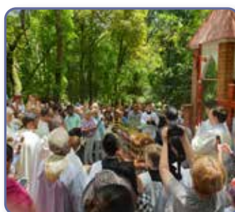
St Therese relic at her Chapel