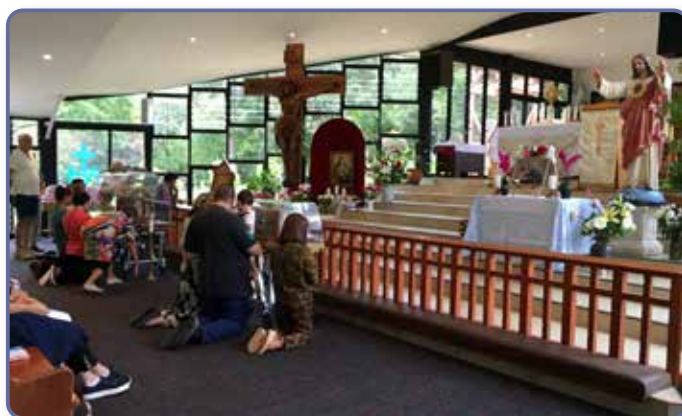
Pilgrims praying around the reliquaries

Sts Louis Martin (22/8/1823 – 29/7/1894) and Marie-Azelie "Zelig" Guerin Martin (23/12/1831 – 28/8/1877) were canonized as saints on 18 October 2015, becoming the first spouses in the church's history to be canonized as a couple. They had nine children, lost four of them at a young age, and the remaining five daughters became nuns.