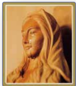
Virgin Mary weeping