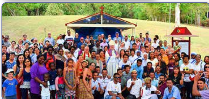
East Timorese gathering after Mass