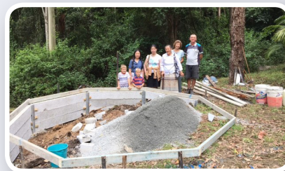
Organisers of Our Lady of Akita Chapel gather for the blessing.

The Community is aiming for the Chapel to be completed for the opening and blessing on Saturday 15th September 2018, which is the Feast of Our Lady of Sorrows.