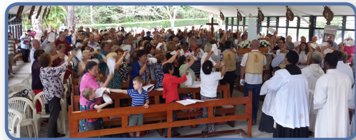
Pilgrims waving white 'flags' at the recessional of the Fatima Mass