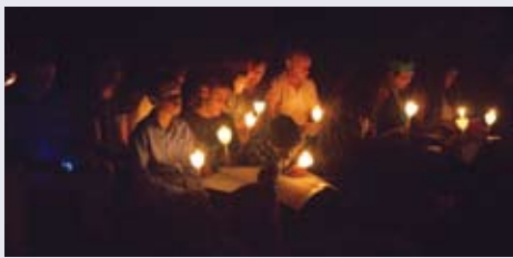
Candle light procession and prayers