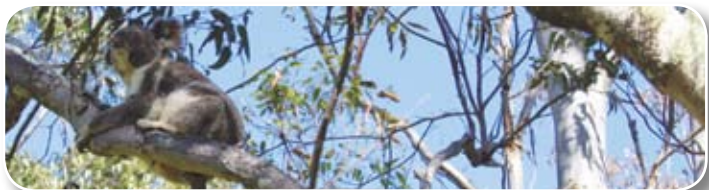
Koala watching the Patriarch

It was a beautiful, though rare sight to see the koala resting in the tree which added an extra blessing for the many pilgrims on this special day.