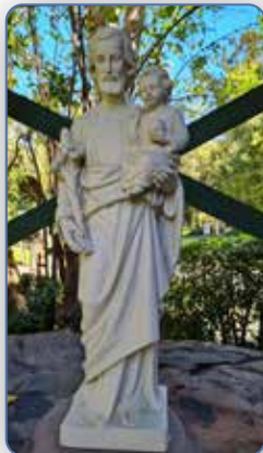
Statue of St Joseph at Grotto