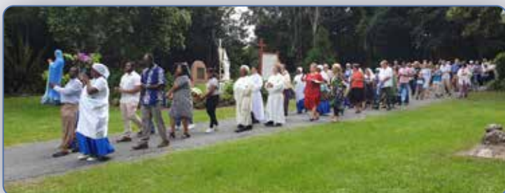
Eucharistic procession to install the statue of Our Lady of Kibeho

At the conclusion of the day, the community invited all the pilgrims to join them for lunch to experience their cultural food.