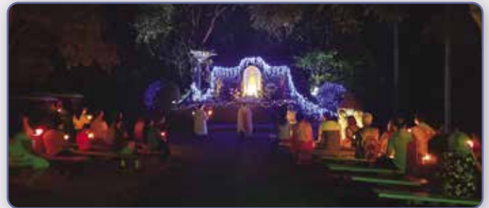
Prayers at Fatima Grotto on New Year's Eve

Each year on New Year's Eve Marian Valley celebrates Mass of Thanksgiving at 7pm, followed by a Eucharistic procession and devotions to the Grotto of Our Lady of Fatima. Pilgrims then process back to the main church for Exposition of the Blessed Sacrament and quiet prayer until Midnight mass for the Solemnity of Mary, the Holy Mother of God. Once again, it was a beautiful and peaceful holy night, and a wonderful way to start the new year.