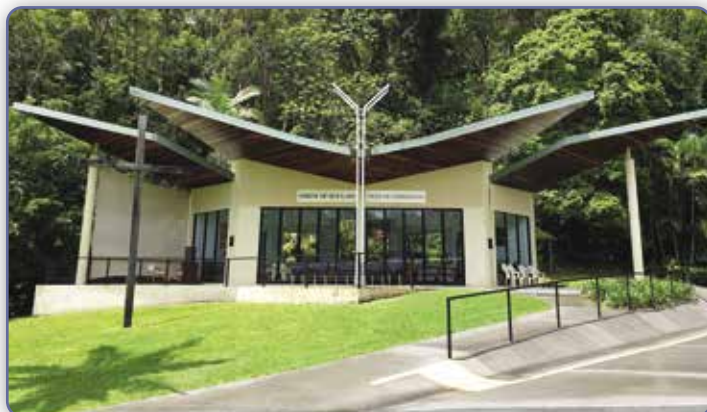
Our Lady Help of Christians Chapel