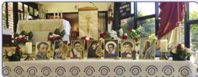
St Francis Xavier, St Mother Teresa, St Vincent de Paul, St Faustina Kowalska, St Stanislaus Kostka, St Dominic Savio, St Maria Goretti