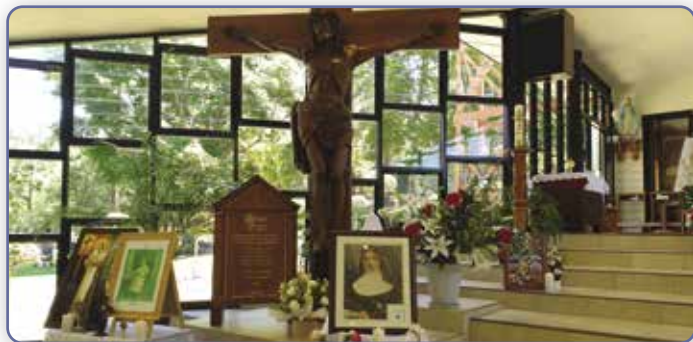
St Paul the First Hermit, St Pius X, St Mary of the Cross (MacKillop)