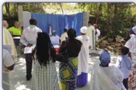
Blessing of Our Lady of Kibeho