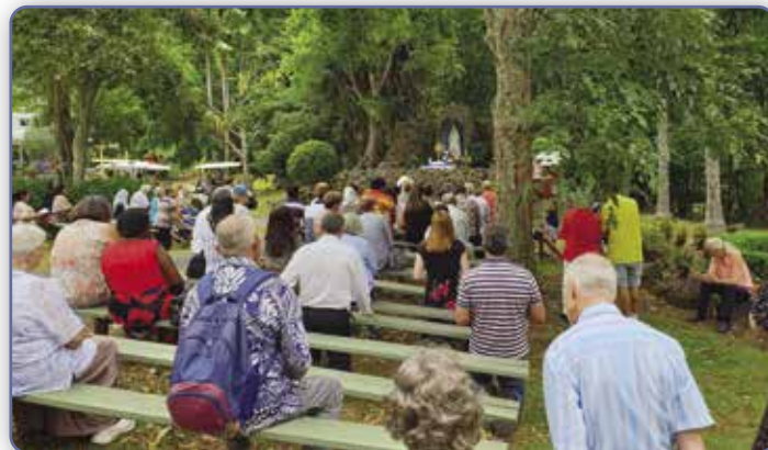
Pilgrims at Fatima Grotto

The Immaculate Conception of Mary is one of four Marian dogmas of the Catholic Church, meaning that it is held to be a truth divinely revealed.