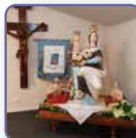
Our Lady of Mt Carmel statue