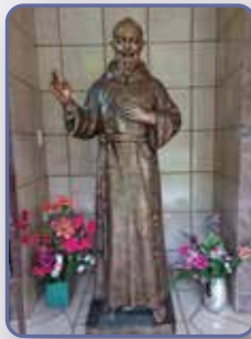
St Padre Pio

"Pray, hope, and don't worry. Worrying is useless. God is merciful and will hear your prayer."