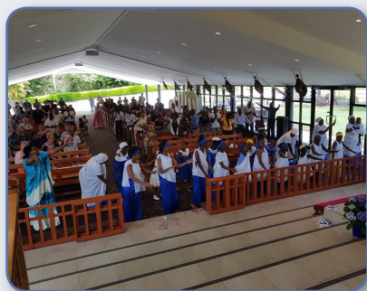
Rwandans performing a thanksgiving dance after Communion

Over the course of the 1980s, the Virgin Mary appeared to several youth. The seers reported that the Virgin asked everyone to pray, to prevent a terrible war. In the vision of 19 August 1982, they all reported seeing violence, dismembered corpses, and destruction. In 1994, over one million Rwandans were slaughtered by their fellow countrymen.