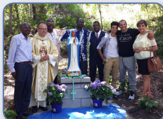
Blessing of statue and Rwandan Chapel site

In 2001, the local Bishop of the Catholic Church officially recognised the visions of three school children as authentic. The feast day of Our Lady of Kibeho is 28 November, the anniversary of the initial apparition in 1981.