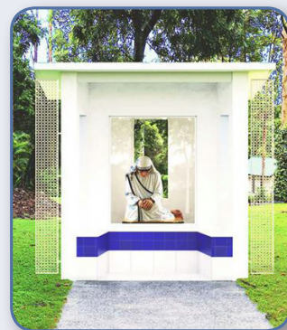
St Mother Teresa Chapel

On Saturday 13th October 2018, around 550 pilgrims journeyed to Marian Valley for the opening and blessing of the Chapel for St Mother Teresa of Calcutta. With heavy rain and bad weather forecast, the Organisers were amazed at the large number of pilgrims who attended.