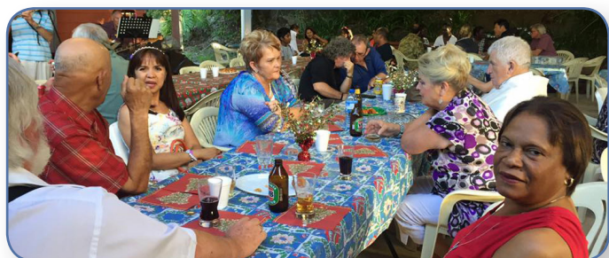
Enjoying the Christmas party