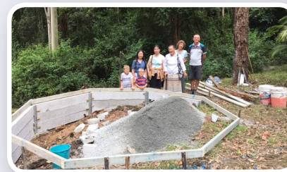
Organisers of Our Lady of Akita Chapel gather for the blessing.

The Community is aiming for the Chapel to be completed for the opening and blessing on Saturday 15th September 2018, which is the Feast of Our Lady of Sorrows.