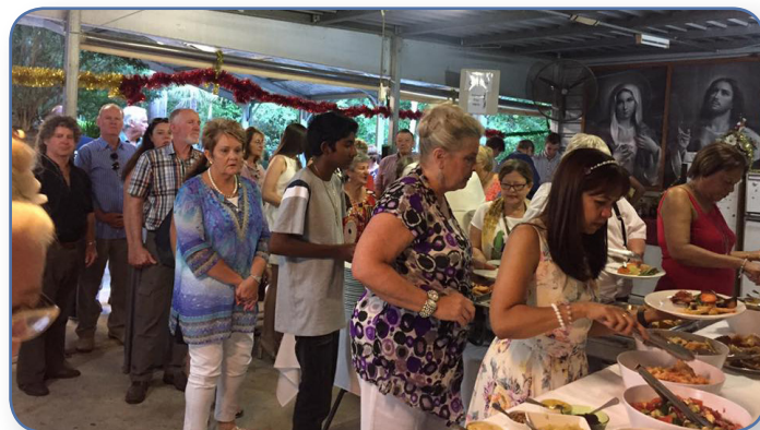
Christmas dinner buffet