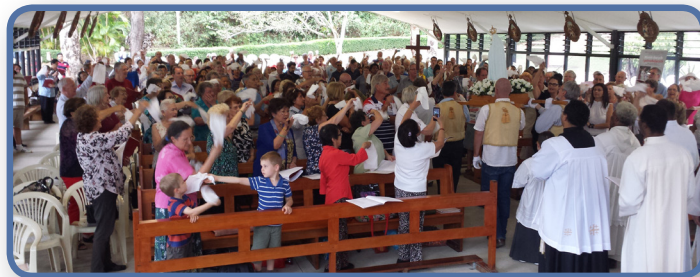
Pilgrims waving white 'flags' at the recessional of the Fatima Mass