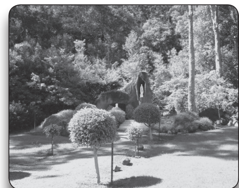
Grotto - Our Lady of LOURDES