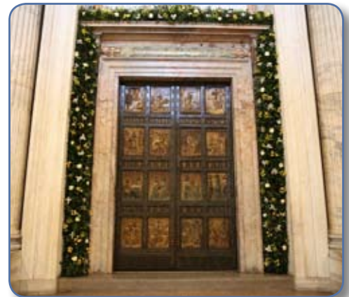
Holy Door - Vatican