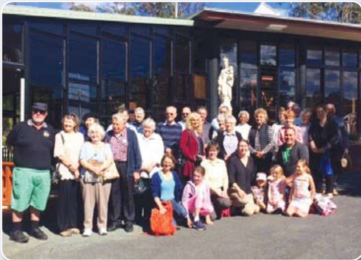
Pilgrims from Boonah Parish