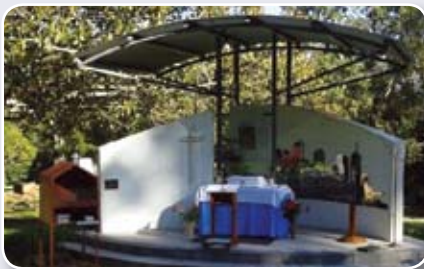
Chapel of St Mary of the Cross (Mary MacKillop)