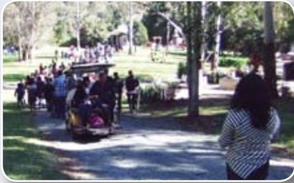
Sri Lankans on procession to the Chapel of Our Lady of Madhu