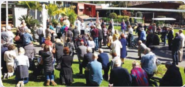
The Polish community praying at their Chapel of St Pope John Paul II